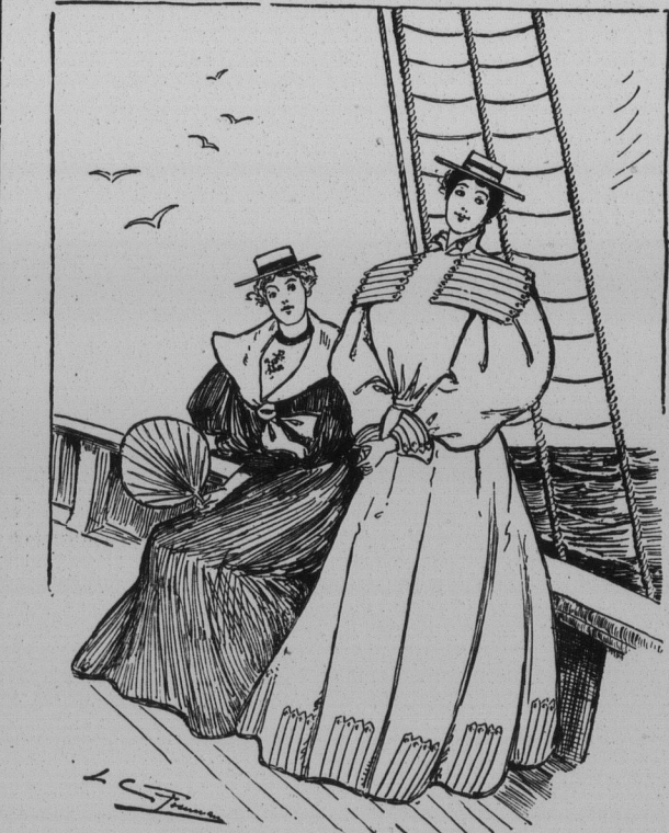
BLUE SERGE AND WHITE BUNTING.

The lovely duchess is making a sensation even in the world of London with her exquisite gowns, and her bewitching array of chiffons. English ladies go in for the more solid style of dress heavy silks, brocades and cloths being more suited to their heavier style of beauty and also to their dreary climate, than the fluff and