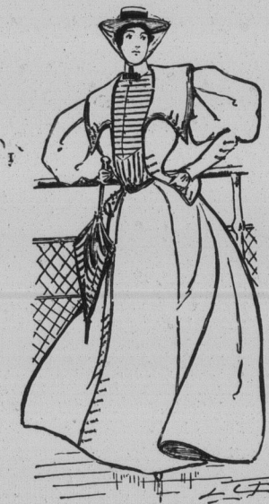
WHITE SAIL CLOTH.

I see that the ladies in England who control the "Ladies' Kennel Journal" and I confess that I never knew of the existence of that periodical until I saw the item referred to—have issued a manifesto setting forth their determination that no dog born after December 1st, 1894—the date when the ladies' memorial against ear-cropping was drawn up—will be advertised in the "Ladies' Kennel Journal" if its ears have been cropped, nor will any dog born after January 1st 1896 whose tail has been docked, be introduced to the public through the pages of the Journal. Thus has one of the most aristocratic avenues to public recognition been closed to all the lunkies, or shall I say lucky, canines whose ears and caudal appendages have been left as nature made them? In the upper circles of canine swiftness this decision will have almost as much significance as an order from Her Gracious Majesty, that no lady whose ears have ever been pierced for earrings shall appear at a Drawing