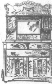
No. 5616—Sideboard Elm, antique finish, top 18x44 in. One long drawer, two small drawers (one lined for silver) $10.75.