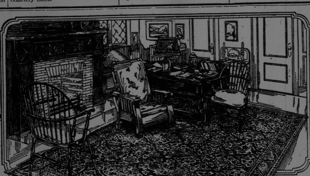
Gold-Seal Congoleum Art-Rug No. 534 is shown on the floor. It is a gorgeous Oriental design in cheerful shades of brown and rose on a rich blue background. In the 9 x 12-foot size it costs only $18.00.