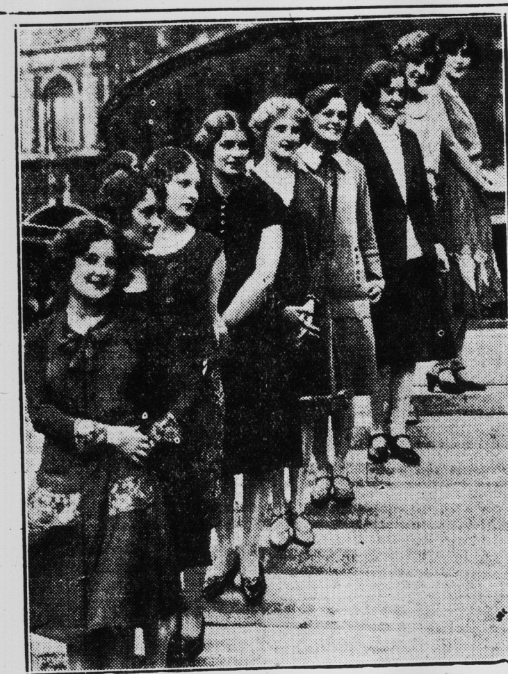
These nine young women were finalists in the elimination contest to choose the most beautiful girl in the British Isles, the winner to get a prize of $5,000 and a five years' film contract. The types varied from perfect Saxon blondes, through all the shades of brown to decided brun-