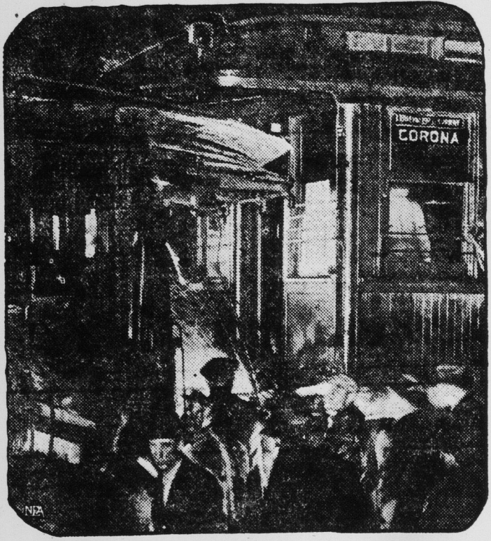
Thirty-seven persons were injured, some fatally, when one subway train, bound for Elmhurst, New York City, crashed into another going the same direction. Faulty brakes and slippery tracks are blamed for the accident, and old wooden coaches increased the damage. Here are splintered car platforms.