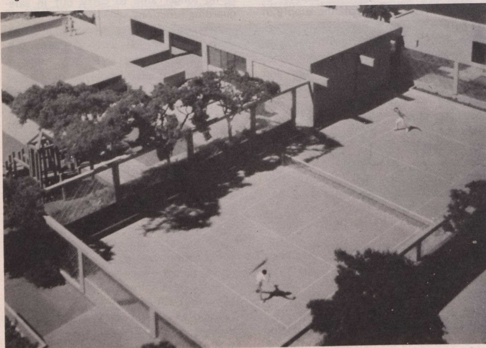
A view of recreation facilities including tennis courts and swimming pool (upper left).

from Canada, as will the mechanical and electrical equipment. The embassy will meet Canadian standards for insulation, although the Chinese building code does not require the material.