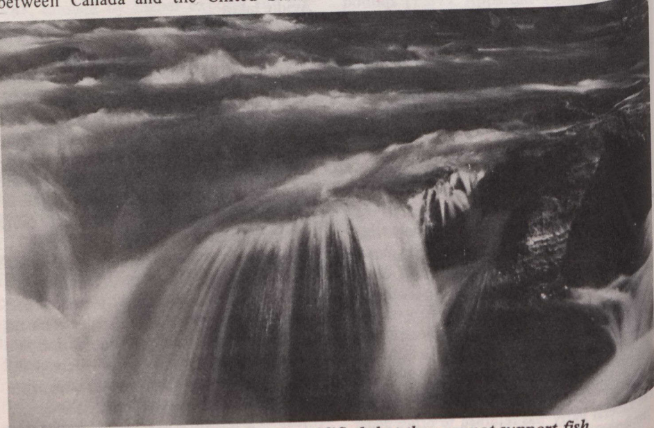
Some rivers and lakes have become so acidified that they cannot support fish.