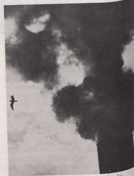
Pollutants are turned into acid rain.

"I am...certain that responsible Americans recognize that our mutual obligations must be met by dealing with the causes of acid rain to prevent further damage rather than concentrating on remedies for damage after it has occurred," said the minister.