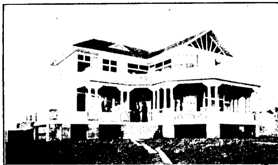
Waterloo County and Country Club House, Galt, Ont.