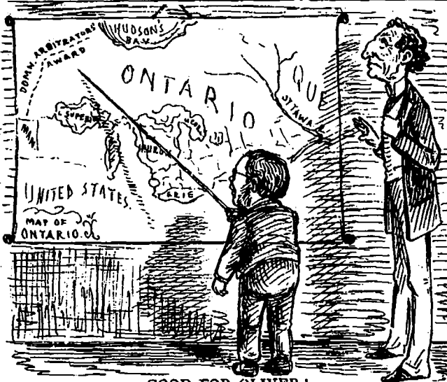
GOOD FOR OLIVER!

MASTER OLIVER MOWAT (repeating the boundaries of Ontario)—"On the west by—" Head Master—"Careful now about the west." Master MOWAT energetically—"Round on the west by the obstructive policy of the Ottawa Government!"