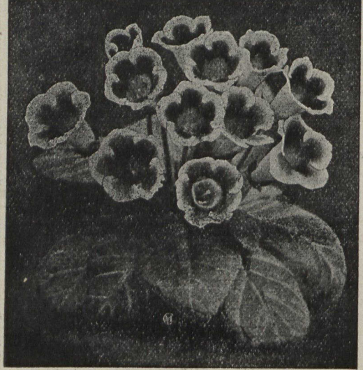
SUTTON'S GIANT GLOXINIA