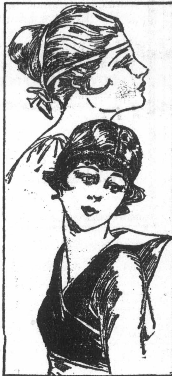
New Coiffures for Girls.

Two of the newest headdresses for girls are shown in the accompanying sketch. The profile head shows the classic outline which is so much in fa- vor with the Parisians. The unwaved hair is softly drawn back from the face and twisted into a coil at the back