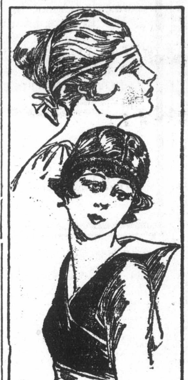
New Colffures for Girls.

Two of the newest headdresses for girls are shown in the accompanying sketch. The profile head shows the classic outline which is so much in favor with the Parisians. The unwaved hair is softly drawn back from the face and twisted into a coil at the back