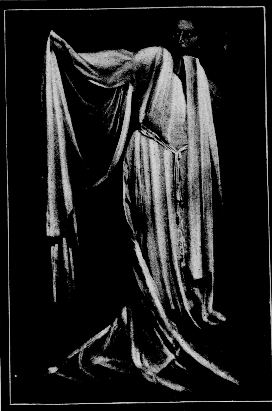
Galli-Curci as Lucia, the heroine of Lucia di Lammermoor, in the famous mad scene