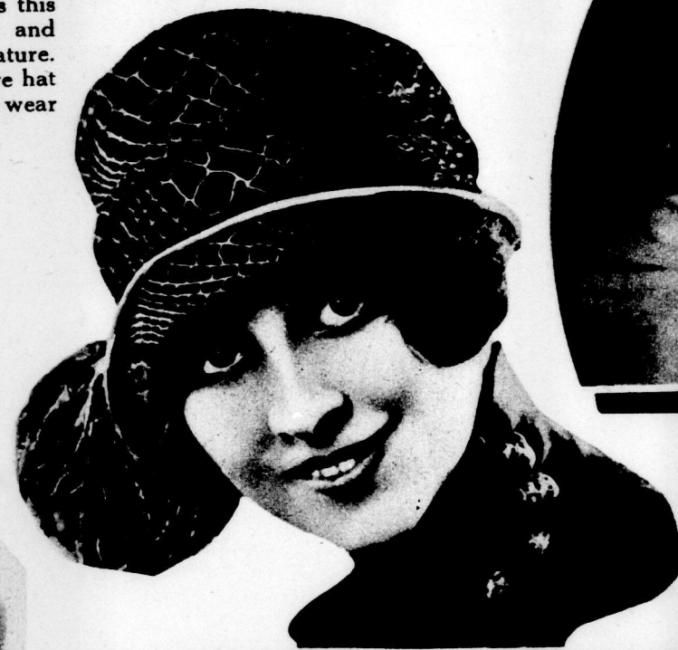
Black velvet with silver threads and pom pom at the side are the features of this fall model