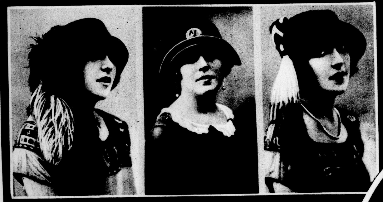
These are going to be worn in Paris this fall. The ostrich plume of black and white on the right is a very smart feature. The black pressed plush of the centre hat is one of the newest materials for fall wear