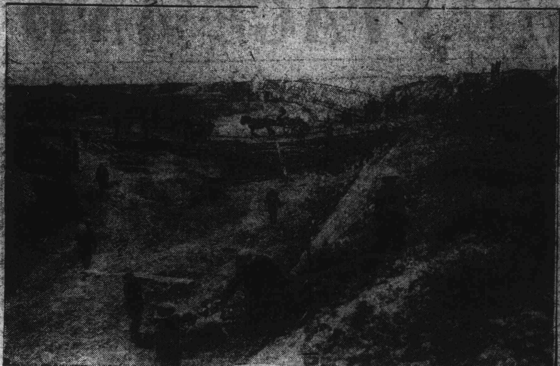
WHERE CANADA'S FORCES BROKE THE HUN LINE

The famous Canal du Nord, showing the construction and cutting across which the Canadians crossed with their supports and supplies. The picture is from a Canadian official photograph just received in Toronto.