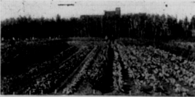
A Returned Soldier among his Prize Winning Vegetables.

These are the names of a few varieties that have stood up with us, and are the limit in hardiness and quality in our experience. We strongly advise all growers of this popular fruit that the best fruit is obtained from young plantations. After taking five or six crops, plow up the old plantation. Of course have a young one coming up to replace the old. Old canes after fruiting should not be removed until the following spring, as they afford a certain amount of protection by assisting in holding snow. On removing these old canes in spring, it is well to burn them and thereby lessen the danger from raspberry insects.