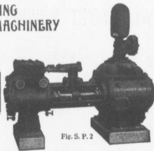
Fig. S. P. 2

The Canadian Fairbanks Co., Limited MONTREAL TORONTO WINNIPEG VANCOUVER