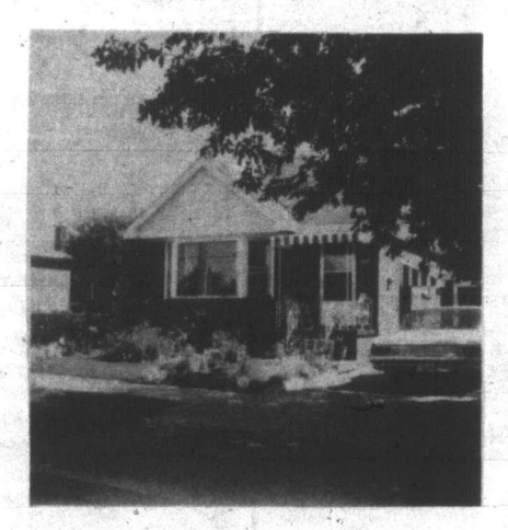
Solid Brick Bungalow

I have a beautifully crafted executive home for you just five mins., from corner Hwy. 5.8.10. Professionally decorated for professional people featuring off-white carpeting in living room and dining room. Cosy family room with all brick fireplace and walkout to patio. Pool size lot and everything first quality inside. You can be proud to entertain your friends here. For details call Sheryl Simpson 270-3403.