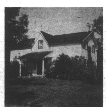
Suburban-"Living at it's Best"

Rambling back-split on quiet cul-de-sac leading to park. Almost half acre of tastefully landscaped yard. the yard. This is country living with the city around the corner. Close to schools, shopping and bus to Toronto. Follow picturesque Meadow Wood Road to the very end, turn right, then right again toward Meadow Wood Park. OPEN HOUSE — Sat. and Sun., or call Sheryl