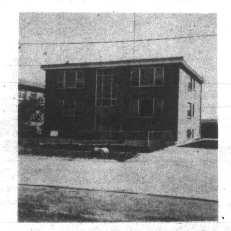
Looking for Investment Property

There is really no question as this house has all the condition of the second as the second as convenience to schools and shopping, 4 bedrooms, completely finished downstairs and 3 washrooms, $31,900. Call Tom