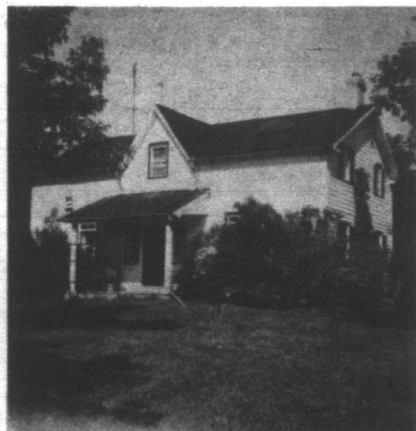
Suburban—"Living at it's Best"

There is really no question as this house has all the amenities one could desire as convenience to schools and shopping, 4 bedrooms, completely finished downstairs and 3 washrooms. $31,900. Call Tom Crothers 270-3403.