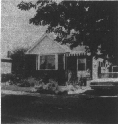
Solid Brick Bungalow

1/4 acres in Prime location. Very large rooms, double garage, pool... This property has loads of potential for future development! For more information call Ron Kaye 270-3403.