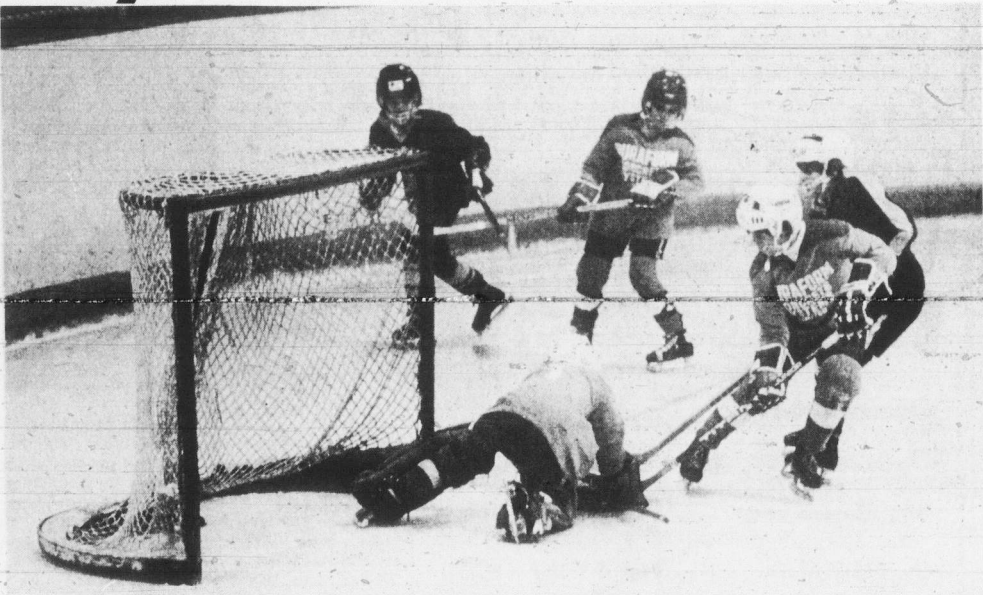
Action in Mississauga AAA is hot and heavy as dark jerseyed Lorne Park player moves in on Erindale net.