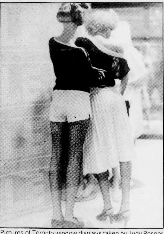
Pictures of Toronto window displays taken by Judy Posner that combine sexual suggestion and female bondage.

One male in the audience claimed Posner was attempting to brainwash the audience and that many of the violent scenes would have been given a second glance by an uninformed passerby.