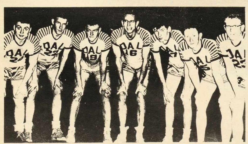
VARSITY BASKETBALL, 1955