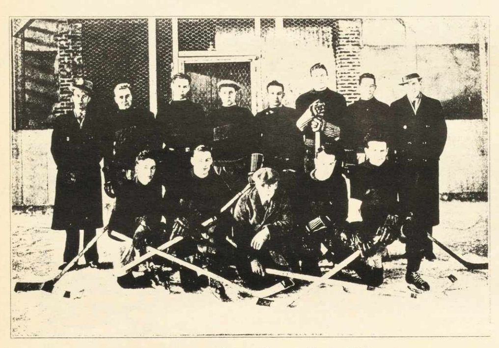
SENIOR HOCKEY TEAM, 1932