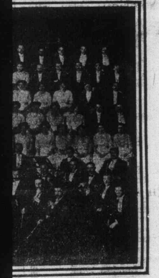
HT, FEBRUARY THE 15TH.

Jelrose, Tricotine, Duch-Chiffon, Panama, Silk here, Voile, Gabardine. in full range of colors,