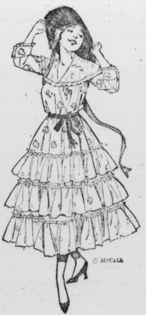
Flowered Organdy with Georgette Collar

There are sprigged and dotted dimities, embroidered and printed voiles, flowered organdies, embroidered muslins, and batistes, each with its corresponding plain material, to