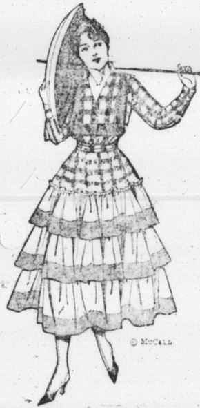
Plain and Blocked Voile Taffeta Trimmed

Last summer we took crotone from the upholstery department and transferred it in great quantities to the dressgoods counter; still on the look-out for novelties, we discovered this season, that the plain and striped cotton and linen homespun, intended for summer cottage furnishings, were charmingly suited to sports suits and skirts, being especially practical for those which require a bit harder wear than the ordinary linen or silk garment will stand. These also have the natural crash and linen grounds, and are striped in the same tones, bearing the softer shades. The black and white combination is especially smart, and there are bright green, purple, orange, and a wide choice of the other