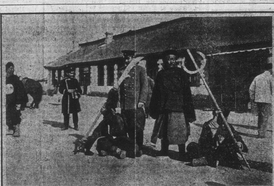
ON THE YALU RIVER.

lish one in Korea. The last reply of Russia was received 5. The engagement on the part of Russia to unimpede the eventual extension of the Korean railway into Southern toral as outside her sphere and interest, | 3. In the preservation of the full free- this afternoon the Imperial court and all