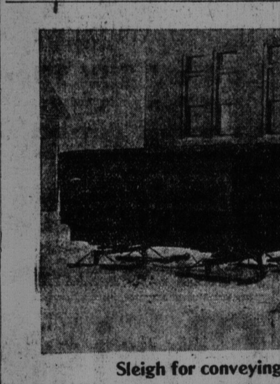
Sleigh for conveying Children in Winter.