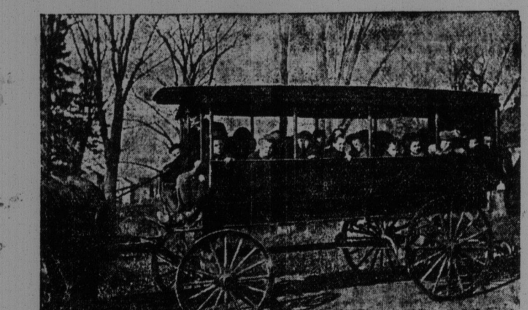
Van for conveying Children in Summer.