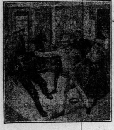
"The Stain of Guilt," at

"The Stain of Guilt" is the title of the new melodrama which will be