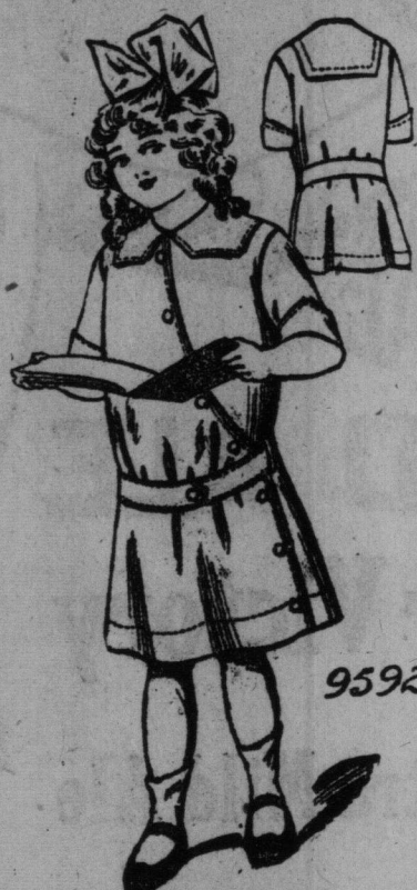
A Natty Comfortable Dress for the Little Miss—Girl's One-Piece Dress.

Tan gingham was used for this model, which provides a most desirable style for a play or morning dress and may also be developed for more dressy occasions. In embroidered linen, dimity, crepe, voile or challis. The closing is in front, a practical and sensible feature. A neat collar and cuffs finish this ideal style. The pattern is cut in four sizes: 4, 6, 8 and 10 years. It requires three yards of 38-inch material for a six-year size. A pattern of this illustration mailed to any address on receipt of 15c in silver or stamps.