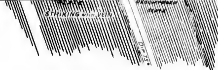
CROSS SECTION of MASON SHAFT