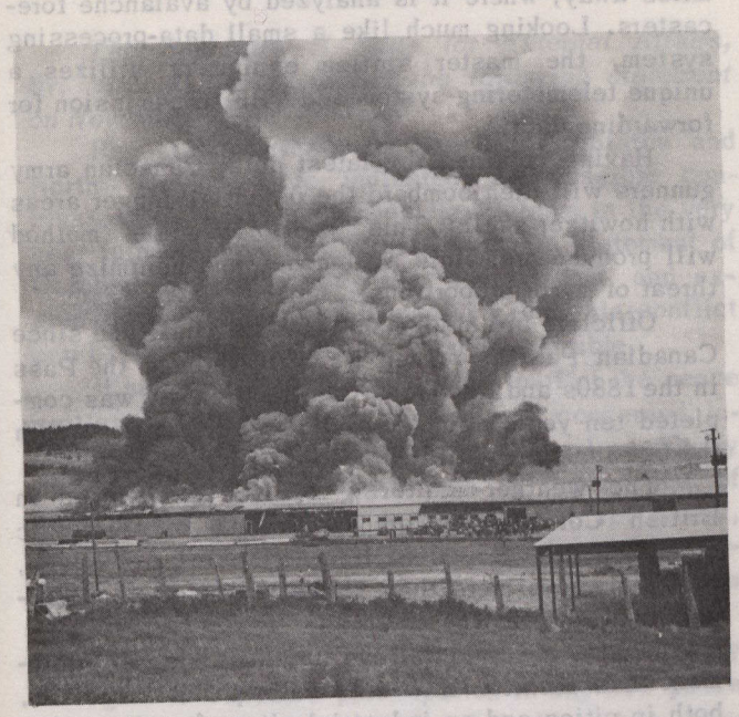
St. Joseph de Beauce factory goes up in smoke.