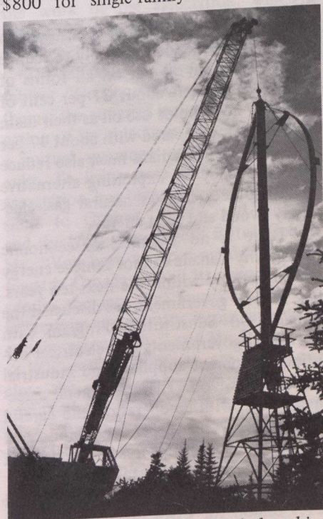
A 50-kilowatt vertical axis wind turbine being erected on Vancouver Island.

The goal of the National Energy Program "is to bring national oil consumption into balance with our assured domestic supply", said the minister. He added that oil