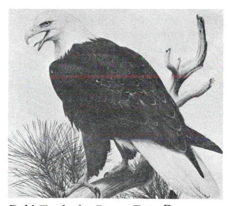
Bald Eagle by Roger Tory Peterson, U.S. (watercolour).