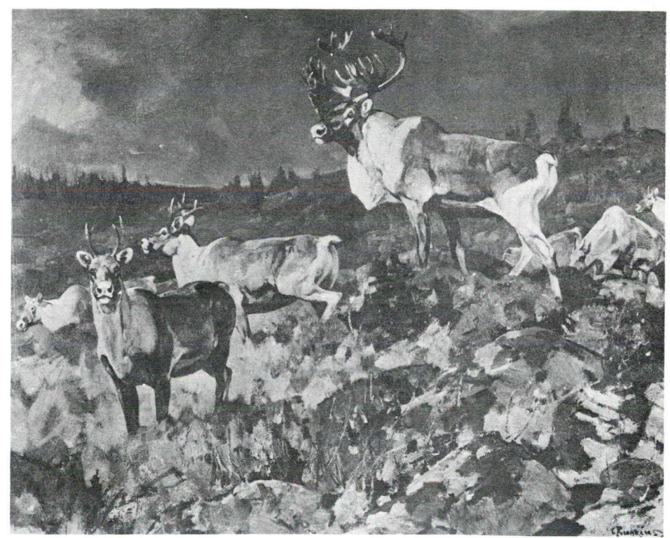
Newfoundland Caribou by Carl Rungius, U.S. (oil on canvas).

Canadian wildlife artists, recognized as among the finest, were represented. They included Terry Shortt, Clarence