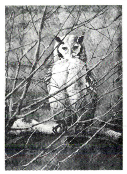
Verreaux's Eagle Owl by Terence Shortt, Canada (casein).

of masters such as Lear, Gould, Audubon, Wolf, Keulemans and Gronvold, usually known only through lithographs or other reproductions. Also represented were the recent renowned painters, Rungius, Fuertes, Bruno Liljefors, Kuhnert and the best of contemporary American, European, Canadian and African artists, whose paintings reflected their distinctive styles.