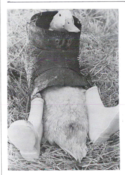
Lame duck not so lame any more

The list of students, broken down by academic discipline, includes the age and areas of specialization of each award-holder, the date he or she expects to complete doctoral work, the degrees already obtained and the date of availability for employment.