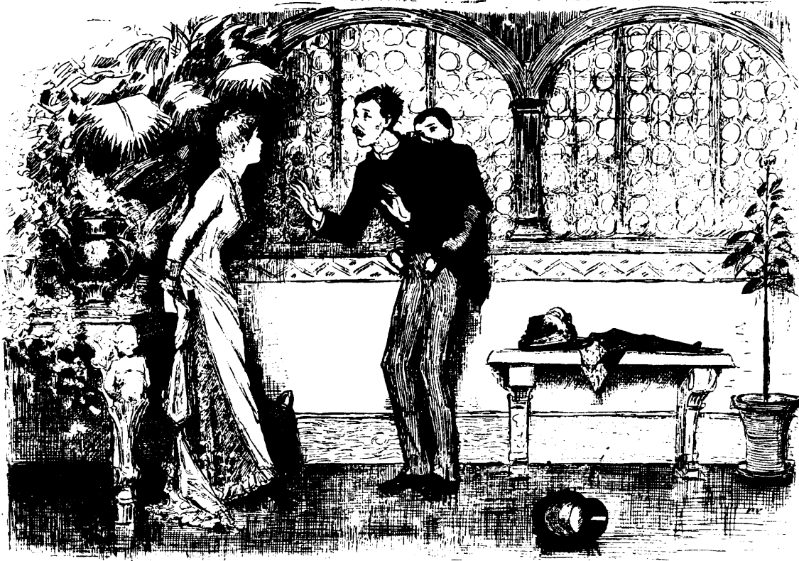
THE POWER OF LOVE.

SHE: Why, Mr. Dehyper! you must not let Freddy make such a nuisance of himself. MR. D. (who has always detested children, and is painfully particular about his dress): Not a bit of a nuisance! We are having a gorgeous time. Hey Freddy? Gasps for breath and prances off up the stairs again.