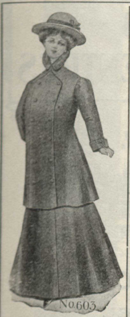
Coat and Skirt to order $14 in real Scotch Tweed.

kept in view in the selection of the Fabrics sold by E. B. Ltd. Great discrimination is exercised in order to gain and retain the confidence of their patrons, and an examination of their collection of Patterns would be a convincing proof of the superior quality and sterling value of the Materials offered.