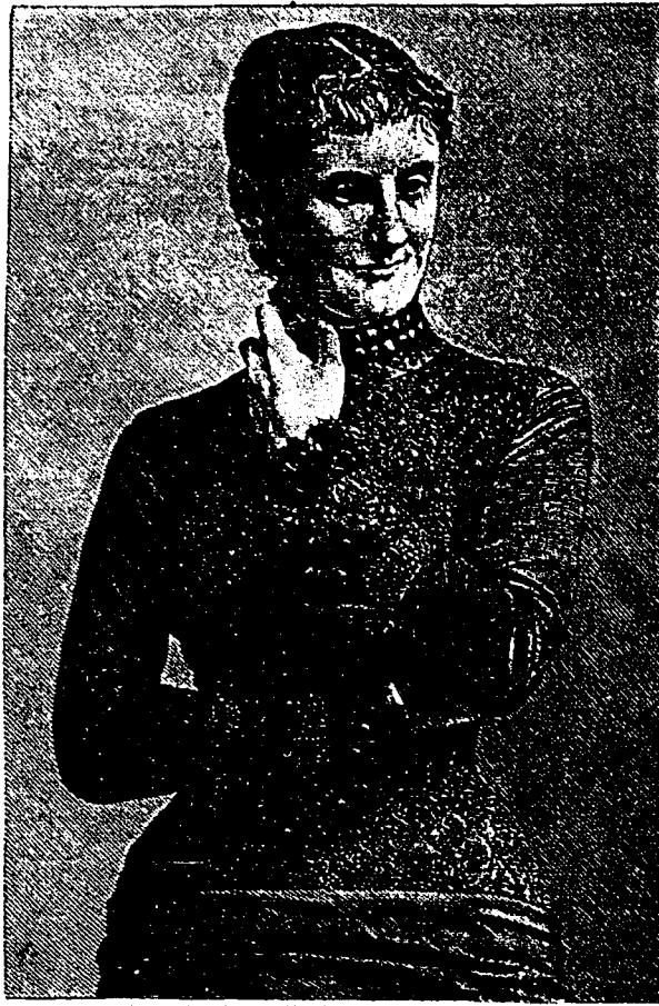
THE MARCHIONESS OF LANSDOWNE, WIFE OF THE NEW GOVERNOR-GENERAL OF CANADA.

Address, G. B. BURLAND, 5 & 7 Bleury Street, Montreal.