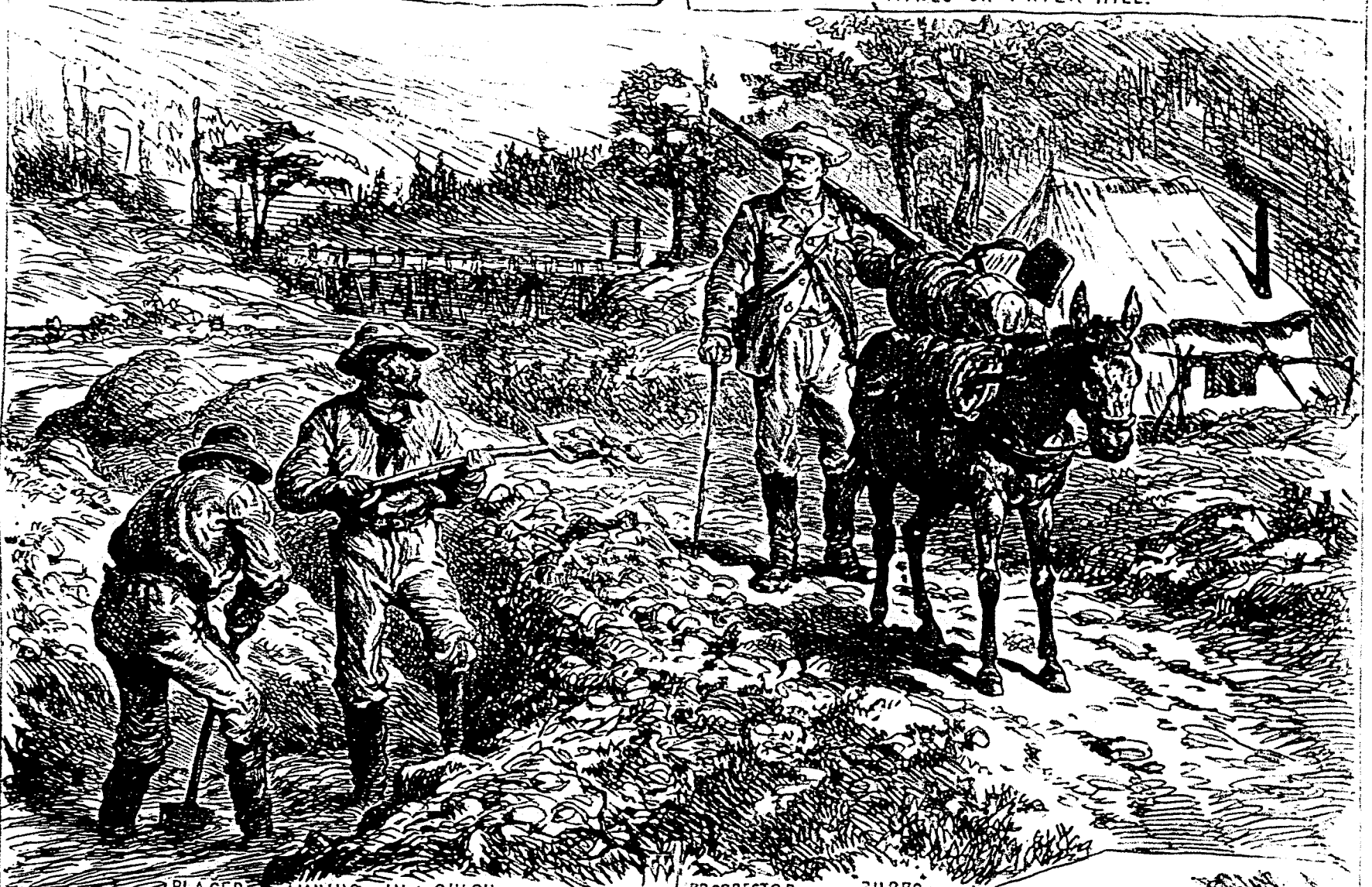
PLACER MINING IN A GULCH.