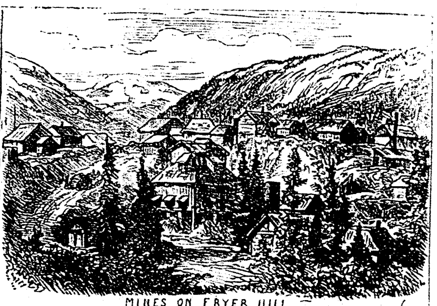
MINES ON FRYER HILL.