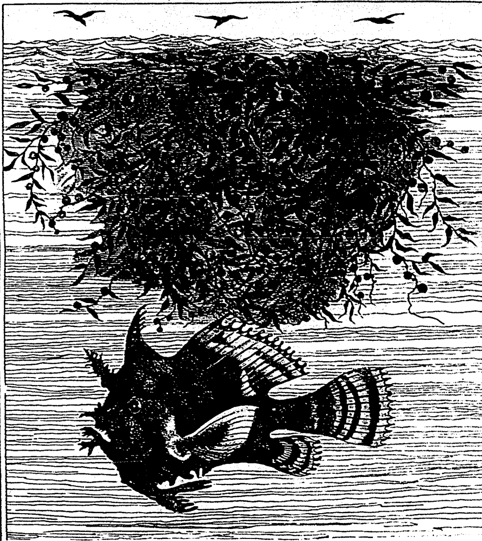
A CURIOUS INHABITANT OF THE SARGASSO SEA AND ITS NEST.