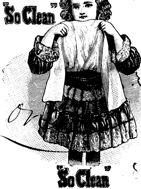
(From the Painting by W. P. FRITH, R.A., Exhibited at the Royal Academy, London, 1889, the property of the Proprietors of "SUNLIGHT SOAP.")