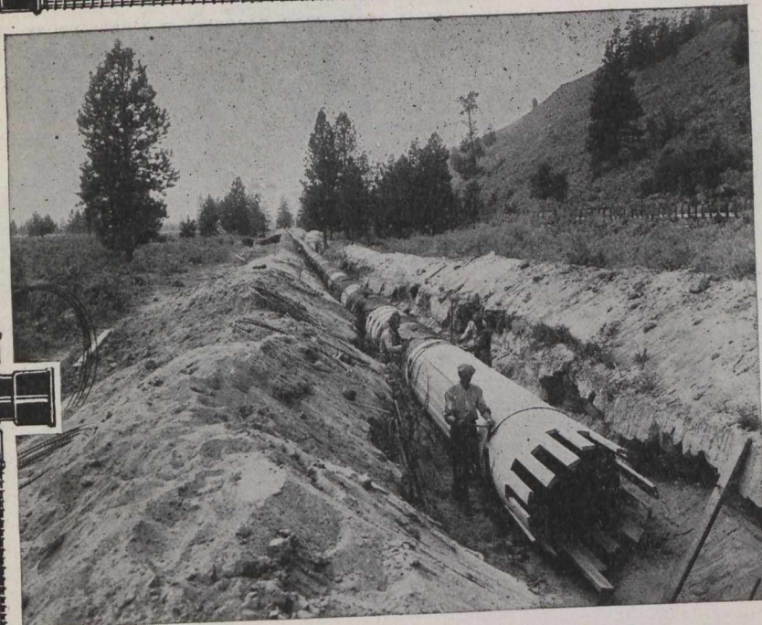
48 in. CONTINUOUS STAVE LINE.

Manufacturer of Galvanized Wire Machine Banded WOOD STAVE PIPE CONTINUOUS STAVE PIPE RESERVOIR TANKS