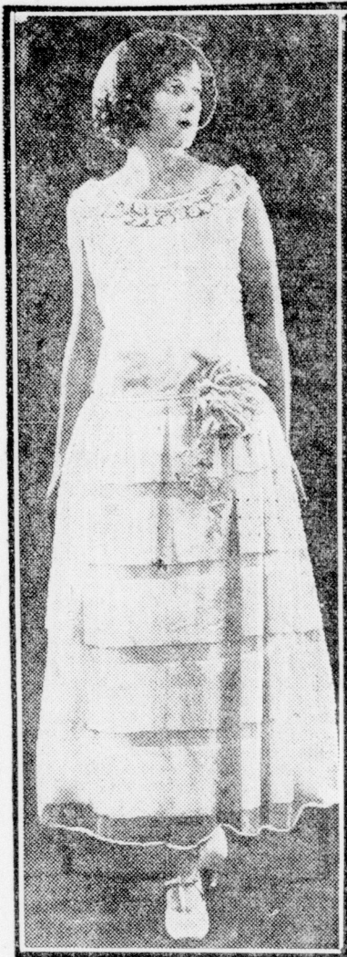
A frock that is pretty enough to make any girl "the belle of the ball." It is of delicate shell pink, with its skirt of moire ribbon bands placed on a foundation of silk net