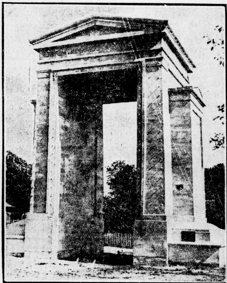
The first "Peace Portal" of its kind stands on the frontier of Canada and the United States—at peace for 111 years. Half of the arch rests in the state of Washington and the other half in British Columbia