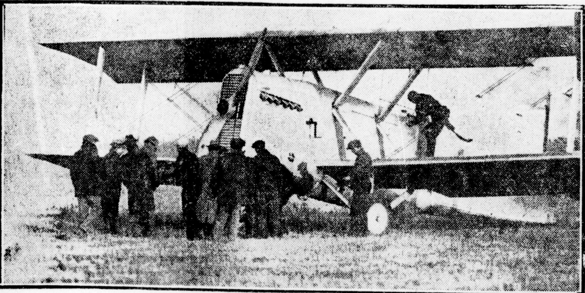
Naval officials are shown testing out an airplane for a preliminary flight at Mitchell Field, Long Island, which will be used for a round-the-world journey if successful in all the tests