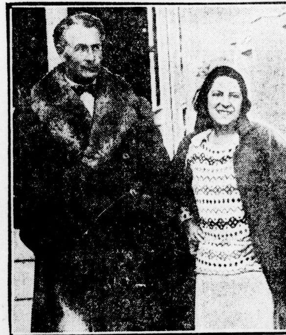
Mlle. Suzanne Lenglen, world's tennis champion, is still playing in top form. She is continuing her game during the winter on the courts of the Riviera, where she is shown with Viscount Cholmondeley