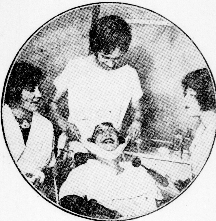
Many famous beauties are taking up the art of becoming their own beauty parlor specialists. Photograph shows some noted Ziegfeld lassies about to apply the marcel wave and "mud" treatment