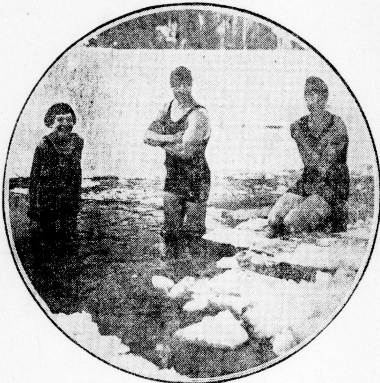
Did you ever try this? With the thermometer registering just a trifle below zero these "water hounds" get that little swim in before nightfall. They say they are right at home in the icy pool