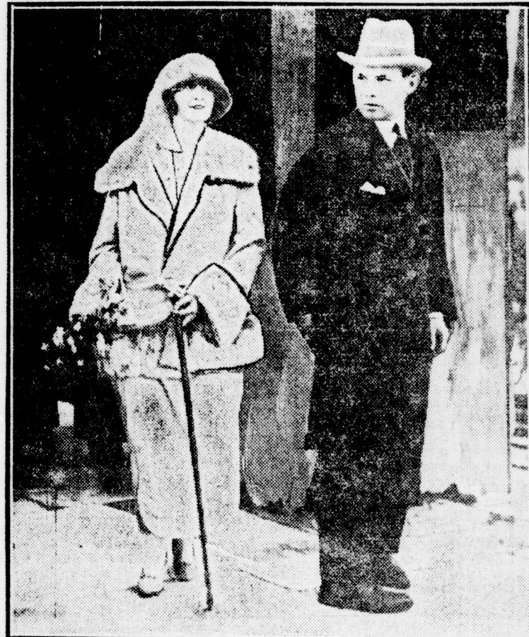
Photograph shows King George and Queen Sophie of Greece at Piraeus, as they departed from Greece for Rumania by order of the Greek revolutionary government