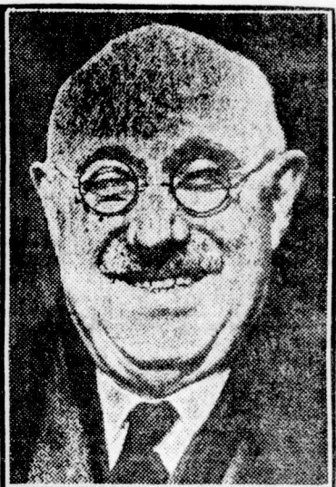
"Pussyfoot" Johnson returned to this continent recently with his usual smile, declaring that he will not die until the whole world goes dry. If his prophecy should come true he may live forever