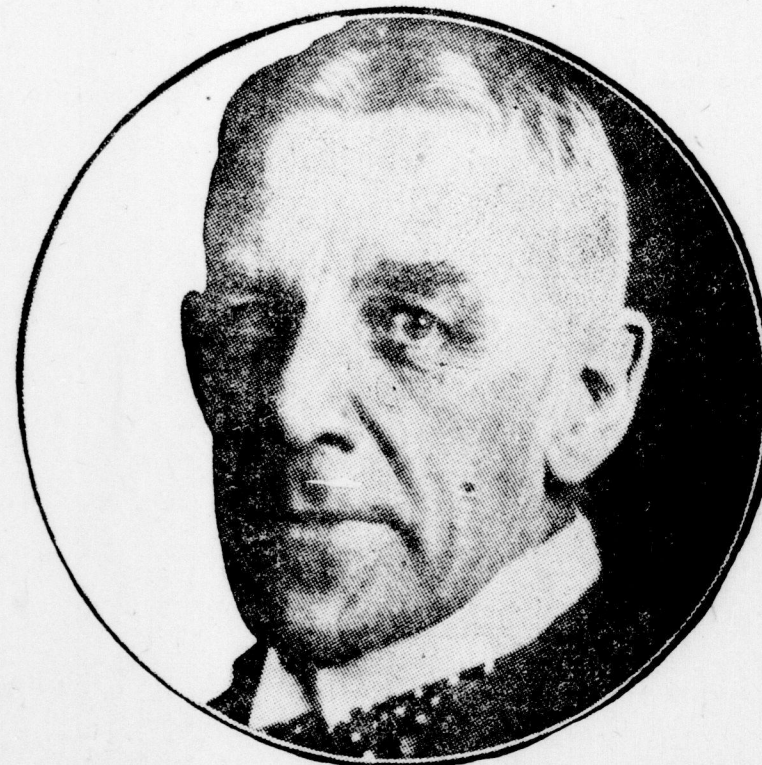
Here's an intimate and close study of Edward W. Bok, the author of the current peace award, which is a prize to the American who could advance the best practical plan by which the U.S. may co-operate to attain and preserve world peace