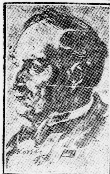
CHRISTIAN RAHOVSKY, Soviet envoy to Anglo-Russ parley, who has asked Moscow to serve an ultimatum on Great Britain.

The masonry and carpentry work, which is of the highest workmanship, was carried out by R. G. Wilson & Sons, and the electric work of instal- ling a system of fans to take care of the hot summer months was done by