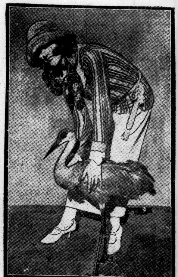
If it isn't one kind of pet it's another. This Cleveland girl has a flair for making friends with storks.