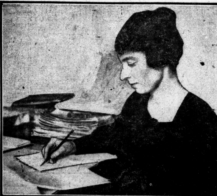
Miss Lucille Atcherson has now been made an official secretary of embassy and will go down in history as America's first woman diplomat.