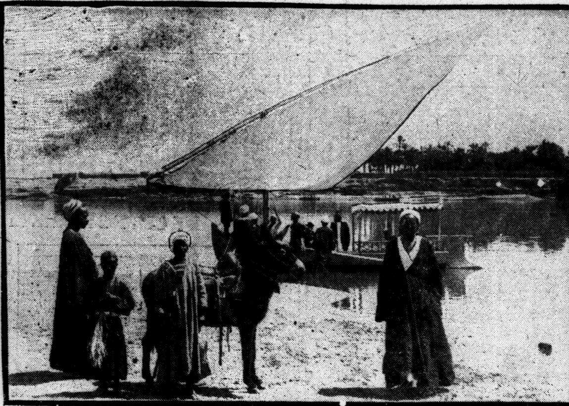
Dragomen and boat at Luxor, Egypt, on the Nile.