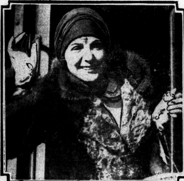
After a considerable time in a variety of countries, Norma Talmadge, movie star, is back in 'Frisco. She is expected to join in the rebellion of big independent stars.