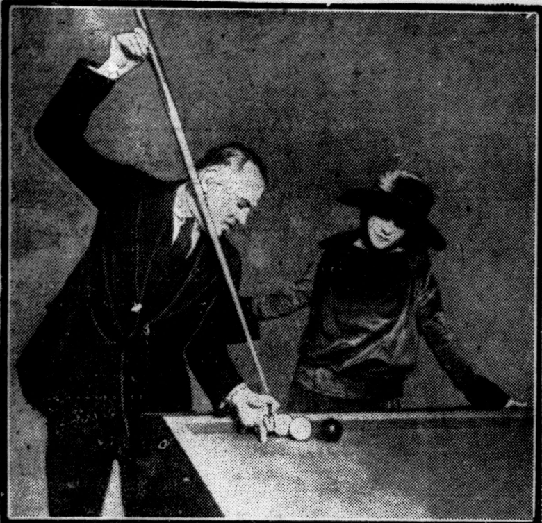
Billiard playing is becoming a regular rage among women. One of the members of a billiard club for actresses taking a few lessons before a tournament.