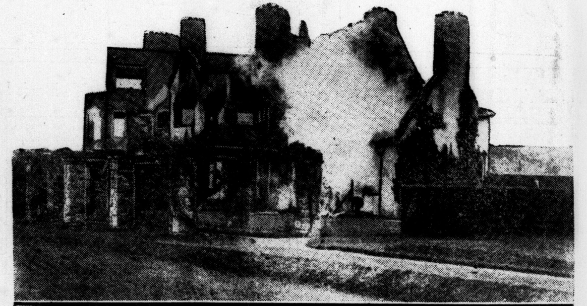
Sir Horace Plunkett's home in Kiltteeragh just after it had been set on fire by armed men.