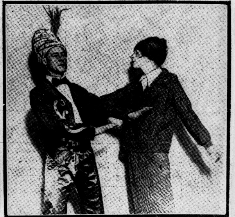
The "lady" on the right is the quarter-back of the Dartmouth football team. The photo was taken at a college carnival.