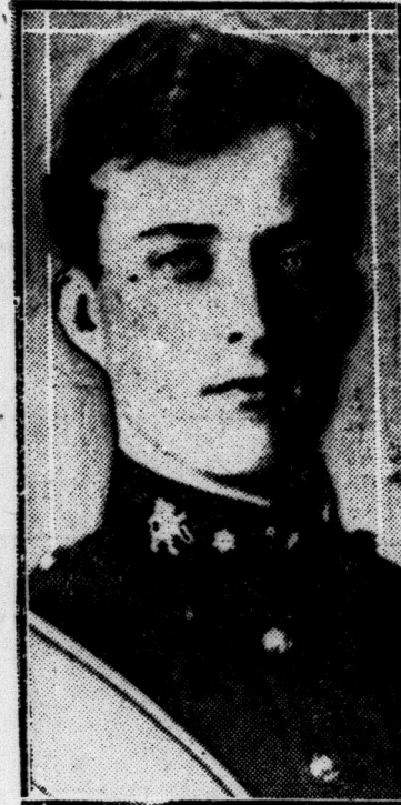
The Crown Prince of Belgium, who is to marry Princess Mafalda of Italy.