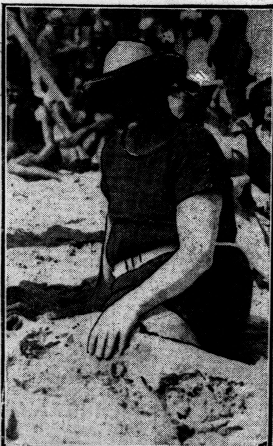
A photo of Mayor Hylan of New York which amuses everyone but himself.