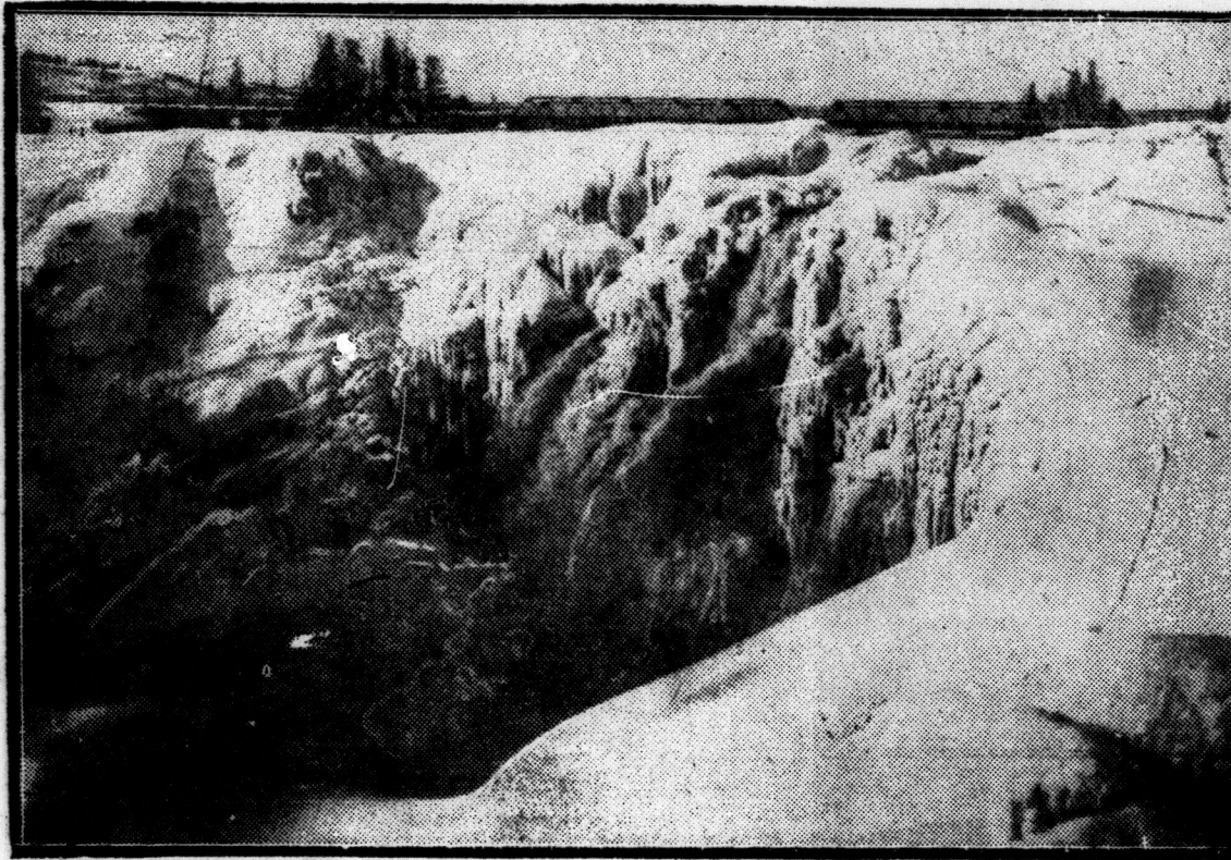
Kakabeka Falls, near Fort William, considered one of the beauty spots of the northern part of the province.