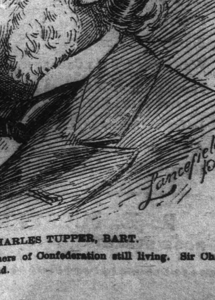
SIR CHARLES TUPPER, BART.

When you tell your-estate in your mouth, breakfast, and then when you see your say, "You are a bill work well in such as Made by the J. C. Ayer.