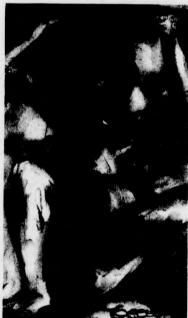
Angst sometimes teeters uneasily between influence and inspiration.