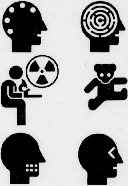
Left: Gert Dunbar's graphics for the Westeinde Ziekenhuis (hospital) in Holland. Pictograms illustrated diseases and services of the hospital.

Here was the speaker that brought a totally holistic approach to design, proving that it is indeed, as Ralph Caplan mentioned, "a process of relationships between things, between things and people, and between people and people."