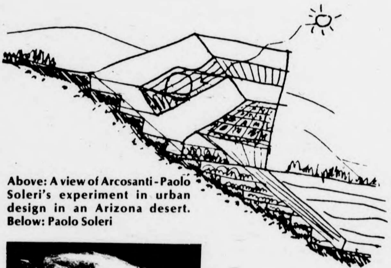
Above: A view of Arcosanti—Paolo Soleri's experiment in urban design in an Arizona desert. Below: Paolo Soleri

Soleri mesmerized the participants of the conference with slides and explanations of a functioning example of alternative urban landscape which he has supervised over the past ten years. Located in the high desert of Central Arizona, 70 miles north of Phoenix, the project exemplifies the concept of ARCOLOGY: a fusion of architecture and ecology, into which he incorporated humanism, paganism, Eastern and Western thought. This term, Soleri explained, addresses itself to energy resources in the environment and