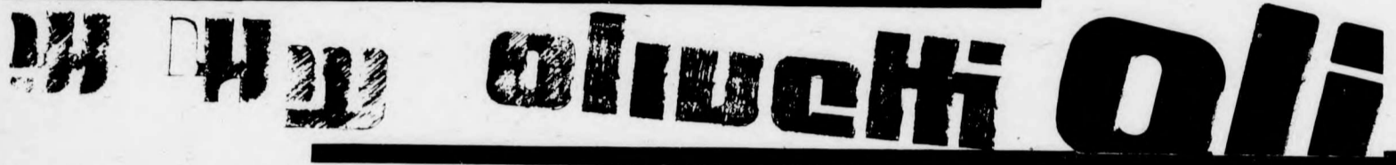
Left: The evolution of the Olivetti logo: "It's hard to define the corporate image and the corporate identity."

Funded through the sale of windbells, sculptures, graphics and research grants, the urban