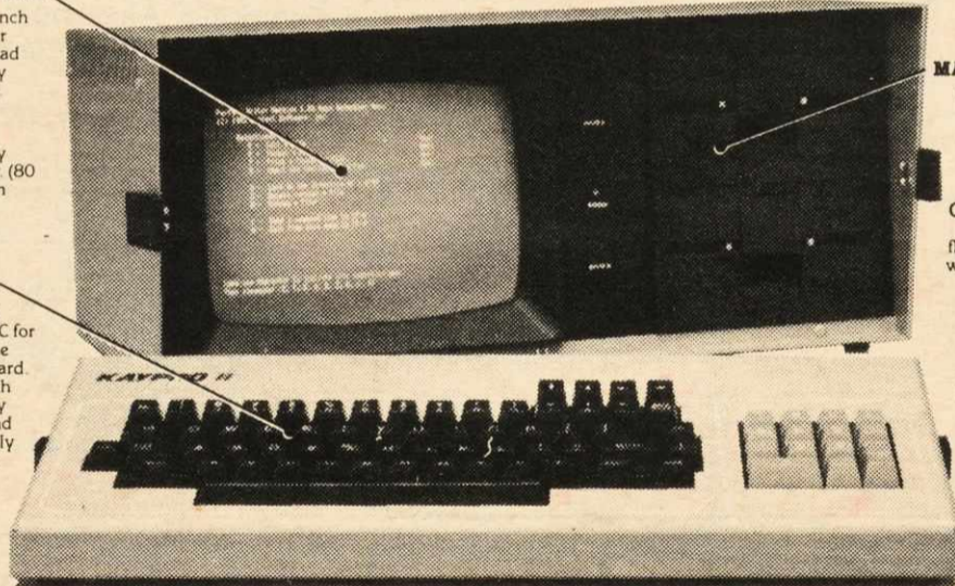
The new Kaypro II portable business computer.

Osborne 1: Standard typewriter detachable keyboard with cursor control keys and 12-key numeric