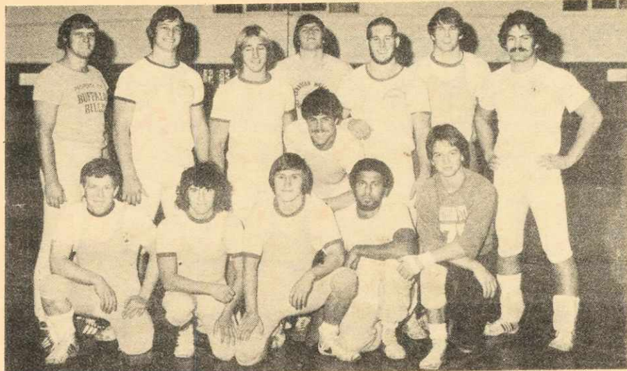
Early indications show that an abundance of talent will carry the team far.