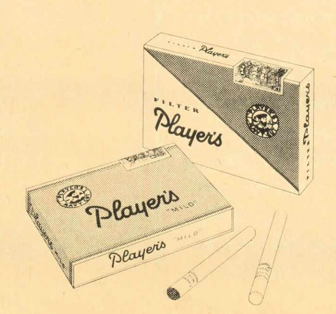
Player's... the best-tasting cigarettes.