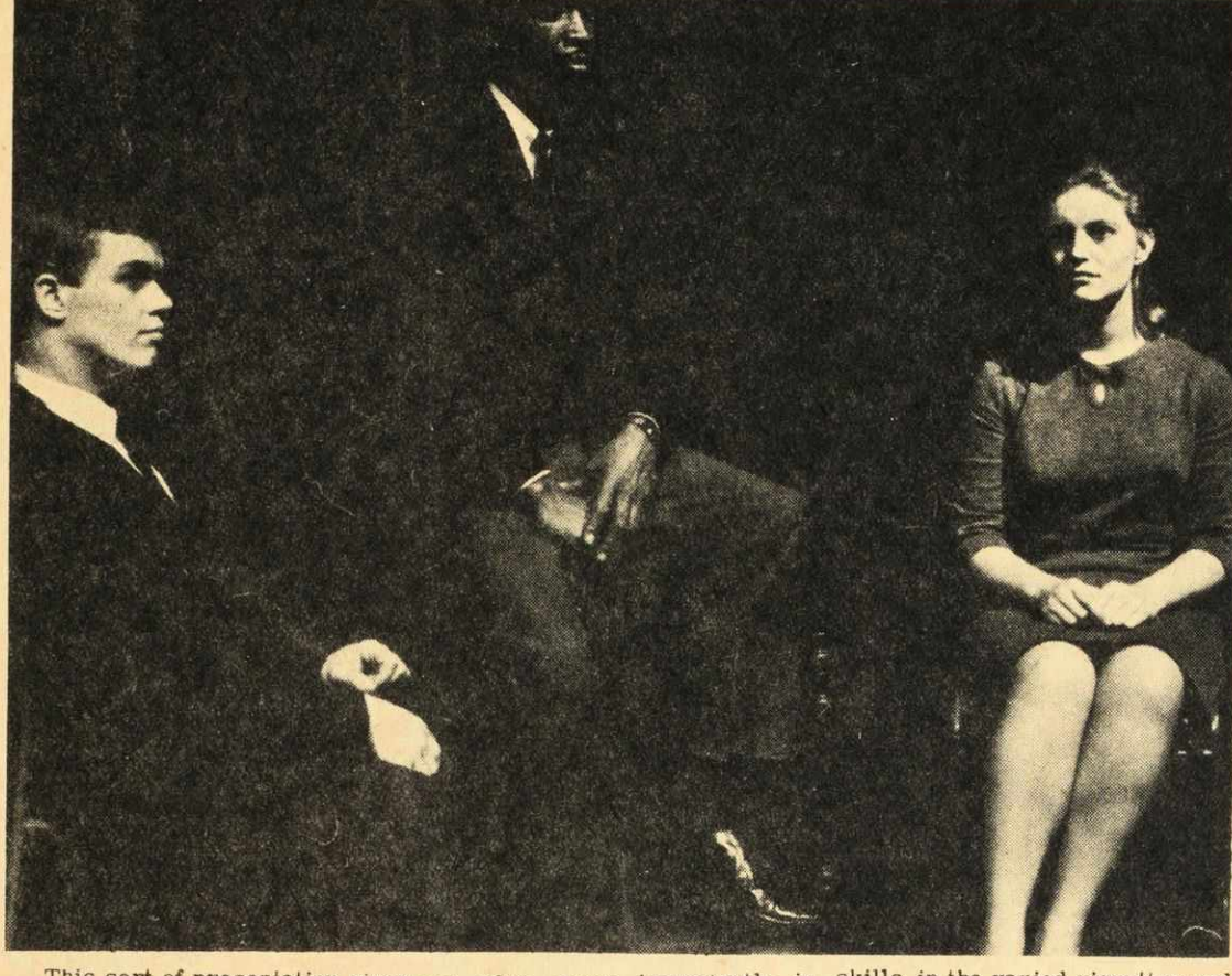
This sort of presentation gives and also, more importantly in skills in the varied vignettes and the audience a series of glimpses, this particular production, an op- orations of the play. from a northern liberal bias, into portunity for neophyte and semiof events to these two climaxes. the American "Negro problem", neophyte actors to display their rose to the occasion. Happily