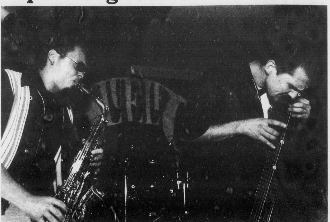
Glueleg were in town on Tuesday night, and there are plenty more bands acomin' too

Friday 10th November at the Dock - The Pursuit of Happiness with Highroad. Tickets are $6 in advance.