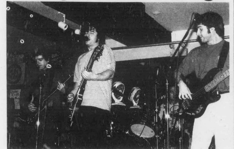
13 Engines down at the Dock