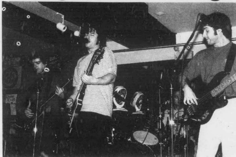
13 Engines down at the Dock