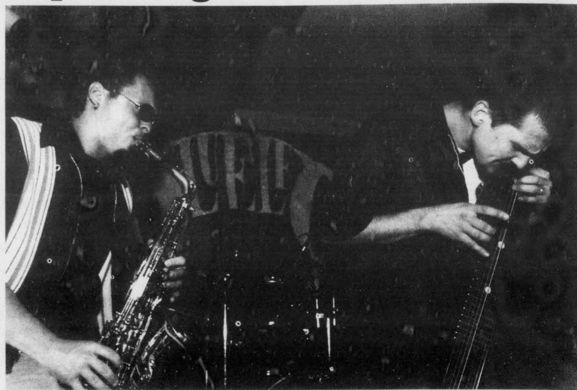
Glueleg were in town on Tuesday night, and there are plenty more bands acomin' too